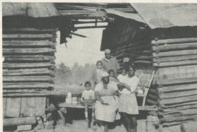
Camden, Alabama family and their house. Rent was past due but this beleaguered family did not have the $40. Operation Freedom gave the family immediate aid.

Operation Freedom immediately made available several hundred dollars, mostly for food, rent, and overdue notes.