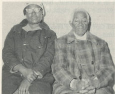
This elderly couple lives in Camden, Alabama. He, 82, still lives on the place where he was born. His mother, before him, had been a slave on this land. Because of activity he was told recently he must get off the place. Operation Freedom hopes to be able to help when and if the couple is evicted.