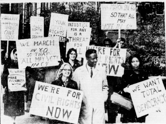
STUDENTS MARCH IN PITTSBURGH...

We reported above that the demonstrations, though linked in spirit and purpose, and by largely informal correspondence, were not coordinated by any formal structure. Under such conditions, their success is especially heartening as an indication of the great potential for Northern student action that remains as yet untapped. The question of how this potential is to be maximally realized and effectively channeled should be a major concern of us all.