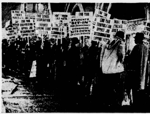
Hundreds of sign-carrying students marched in Chicago's election day civil rights demonstration. The nationwide demonstration was an attempt to remind both parties of the need for effective civil rights guarantees.

It often happens in our country that the most significant events go unreported by the mass media. In our newspapers full pages are devoted to the pomp and circumstances of the social set and the most trivial pronouncements of politicians, while the efforts of real people in pursuit of truly human goals receive little, if any, attention. So it was that astonishment and confusion seized those who could not read the signs when the sit-ins exploded into the national consciousness. And so it was also that an unseeing press, busy manufacturing excitement in the election numbers game, passed over a series of events that were possibly more meaningful finally than the slim resolution of the presidential contest.